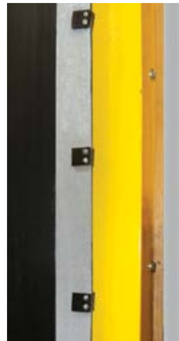
Continuous curtain locks on both edges

* Pressure/wind resistance value is the ultimate pressure tested at door width of 19'. The mph is determined in accordance to ASCE 7-10 EXP B.